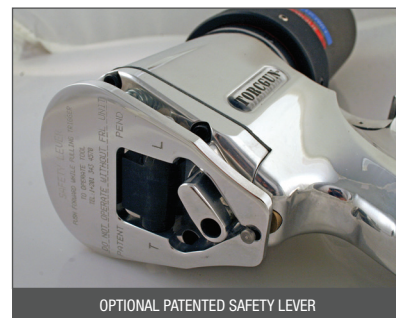
OPTIONAL PATENTED SAFETY LEVER

This safety mechanism drastically reduces operator error. The lever must be depressed while pulling the trigger, ensuring operator keeps hands away from pinch points.