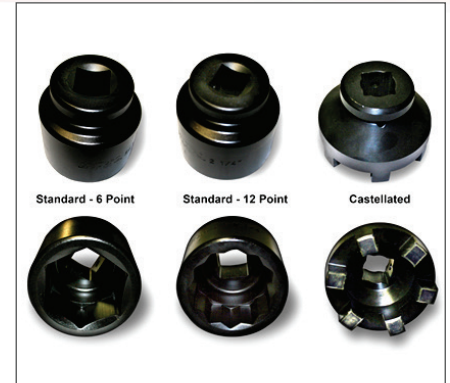
Standard - 6 Point

Filter, Regulator and Lubrication Unit. For use with all torque guns. Optional Silencer Unit to reduce operational noise by 35%, down to a very low 70-75 Db.